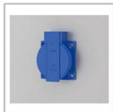
Waterproof Socket 2 waterproof sockets are located in the back panel, optimum convenience of using small devices inside the cabinet.