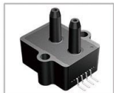
Pressure Sensor High precision pressure sensor, can be real-time pressure detection.