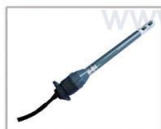
Wind Speed Sensor High precision wind speed sensor, can be real-time wind speed detection.