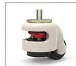
Foot-master Caster Universal aster with brake and leveling feet.